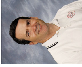
Dr. Jody Hice , Pastor of Bethlehem First Baptist Church, Barrow County, GA is one of the founders of TC-GA and serves as its President.

Ten Commandments ~ GA, Inc. P.O. Box 941 Hartwell, GA 3043