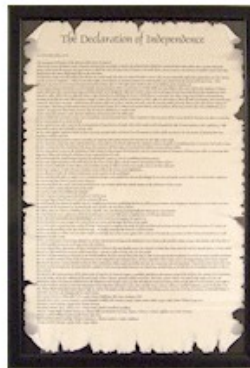
Declaration of Independence