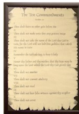
The Ten Commandments