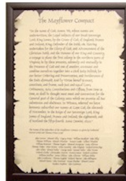
The Mayflower Compact