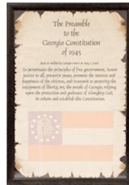
Preamble to the Georgia Constitution