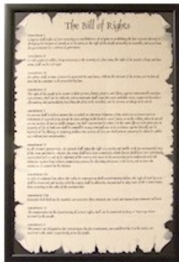
Bill of Rights

The nine-piece historical display is uniquely designed just for this project. They are beautifully displayed in a (18' x 24") wood frame according to the specifications of Georgia's law.