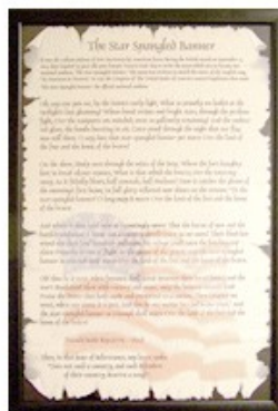
The Star Spangled Banner